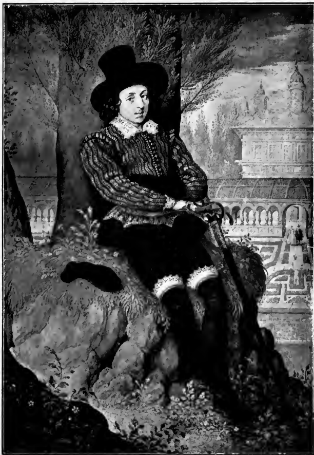
SIR PHILIP SIDNEY, FROM THE MINIATURE BY ISAAC OLIVER AT WINDSOR CASTLE.