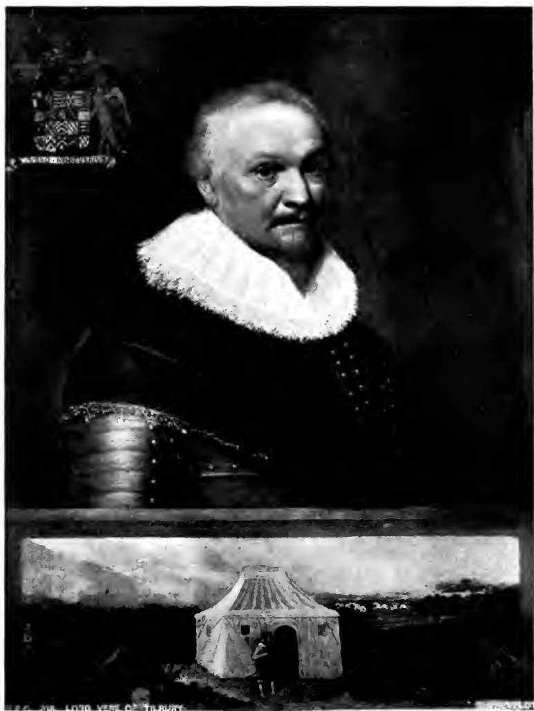
HORACE, LORD VERE OF TIBURY, FROM A PHOTOGRAPH FROM THE PORTRAIT BY M. J. VAN MIERVELDT IN THE NATIONAL PORTRAIT GALLERY, BY PERMISSION OF EMERY WALKER, LIMITED.