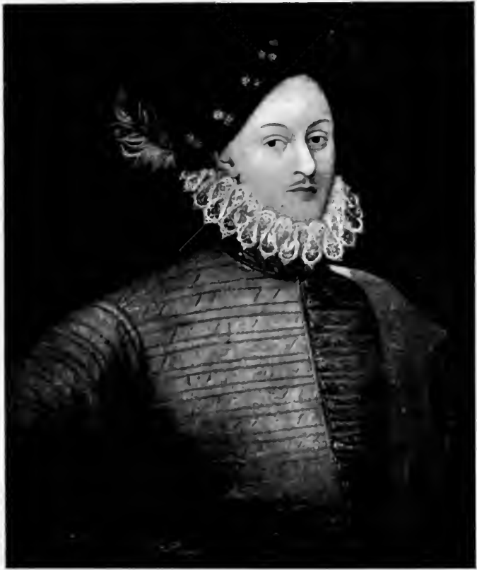
EDWARD DE VERE, SEVENTENTH EARL OF OXFORD—AGE 25 FROM THE PORTRAIT AT WEIBECK ABBEY. REPRODUCED BY PERMISSION OF HIS GRACE THE DUKE OF PORTLAND.