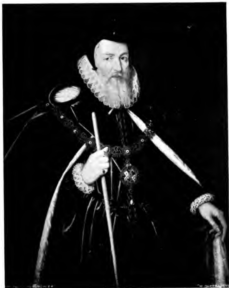
WILLIAM CECIL, FIRST LORD BURGHLEY, K.G., FROM THE PORTRAIT IN THE NATIONAL PORTRAIT GALLERY, ATTRIBUTED TO M. GHEERAEDTS, FROM A PHOTOGRAPH BY EMERY WALKER, LIMITED.